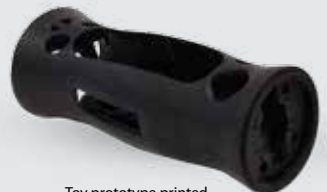
Toy prototype printed in Accura ABS Black

SLA printers are able to print highly detailed, tiny parts just a few mm in size, all the way up to 1.5 m long parts—all at the same exceptional resolution and accuracy. Even large parts remain highly accurate from end-to-end, with virtually no part shrink or warping.