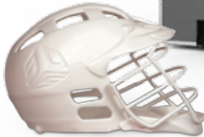
Helmet model printed in Accura Xtreme White 200