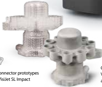
QuickCast® pattern in VisiJet SL Clear, and aluminum casting