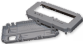
Electronic housing prototype printed in Accura Xtreme