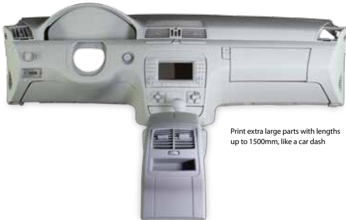
Print extra large parts with lengths up to 1500mm, like a car dash

3D Systems, the inventor of Stereolithography (SLA), brings you legendary precision in 3D printers, fine-tuned for cost-efficiency and unrivaled material availability. These advanced 3D printers produce exact plastic parts without the restrictions of CNC or injection molding. In addition to prototypes and end-use parts, these SLA printers create casting patterns, rapid tooling and fixtures. With speed, accuracy and surface quality of this level, you can produce low- to medium-run parts at a lower per-unit cost and build massive, highly-detailed pieces faster.